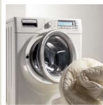
8kg capacity handles large towels, quilts and blankets