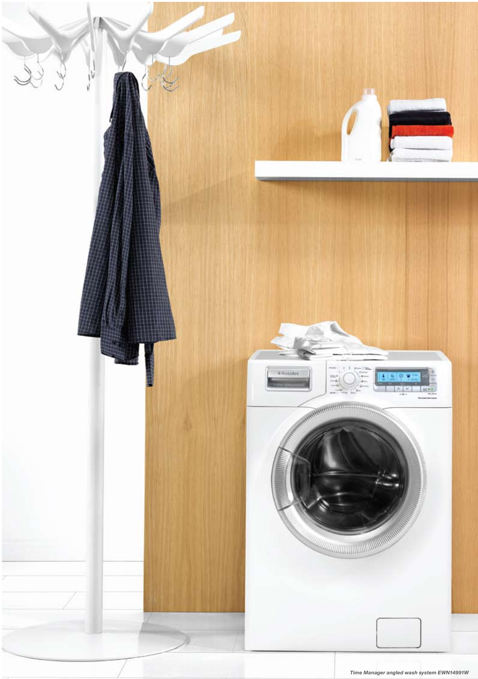
Time Manager angled wash system EWN14991W