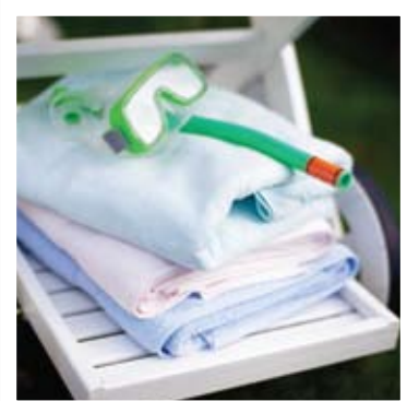
Set the time to suit your lifestyle