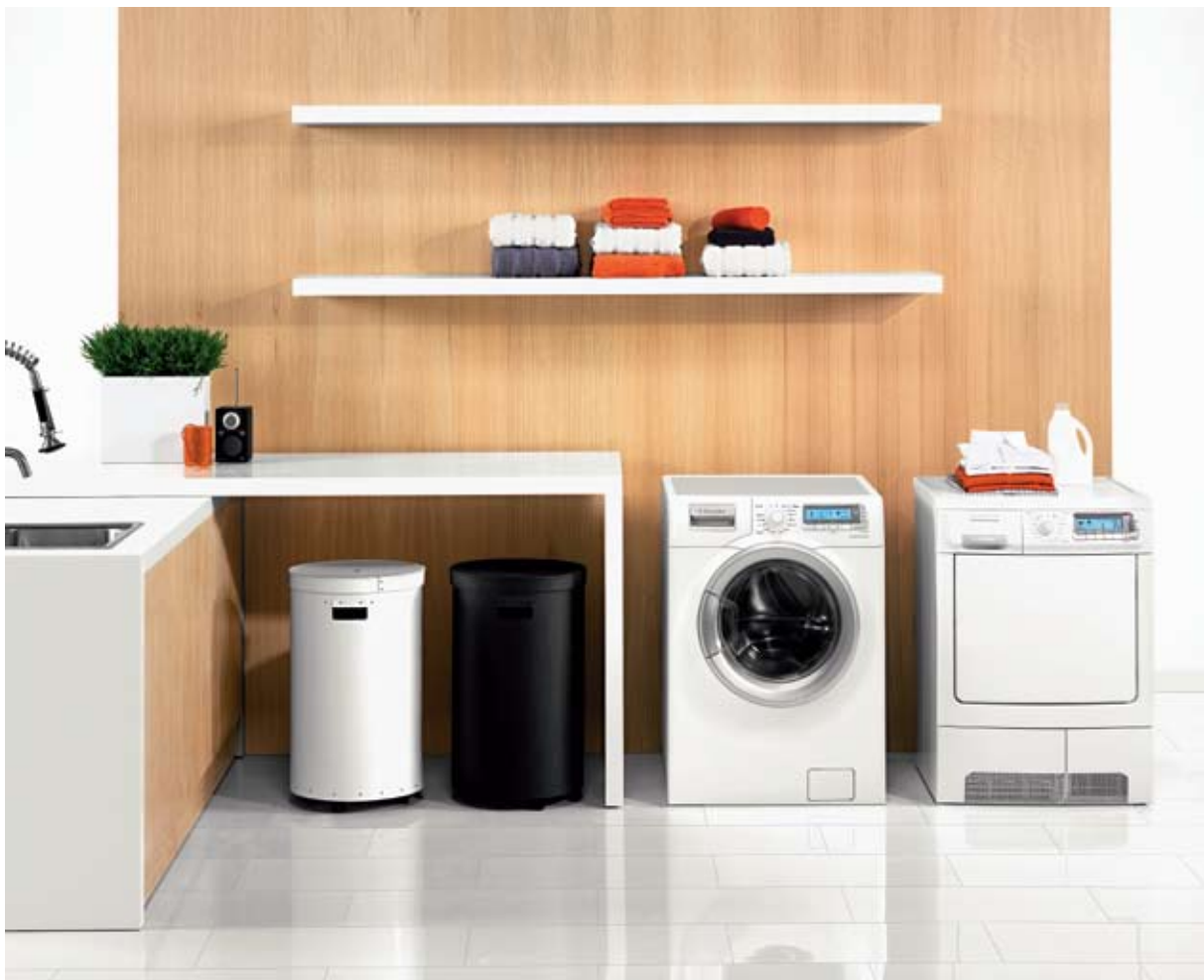
Time Manager angled wash system (EWN14991W) and Energy Star dryer (EDH97950W)

The Electrolux Premium Laundry collection represents significant advances in washing and drying. Each appliance incorporates time saving technology, thoughtful innovation and ergonomic design, to take exceptional care of you and your most delicate garments.