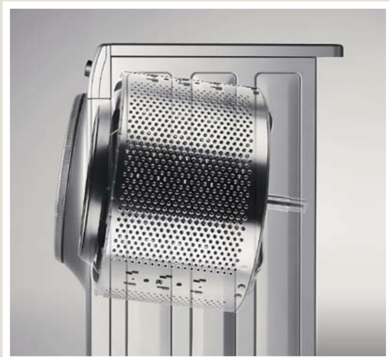
Ergonomically designed angled drum means less bending, alleviating pressure on your back