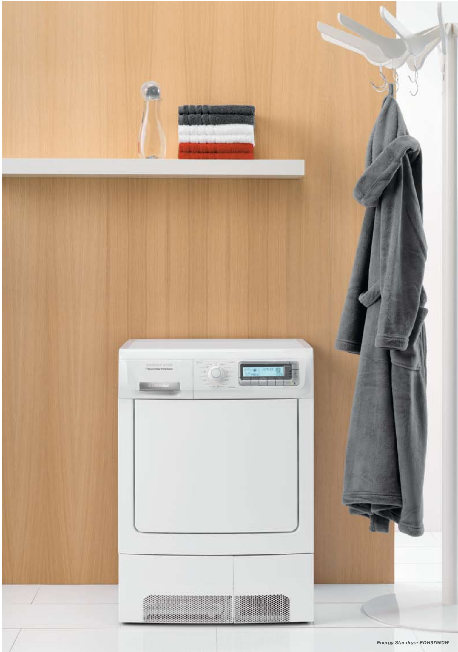
Energy Star dryer EDH97950W